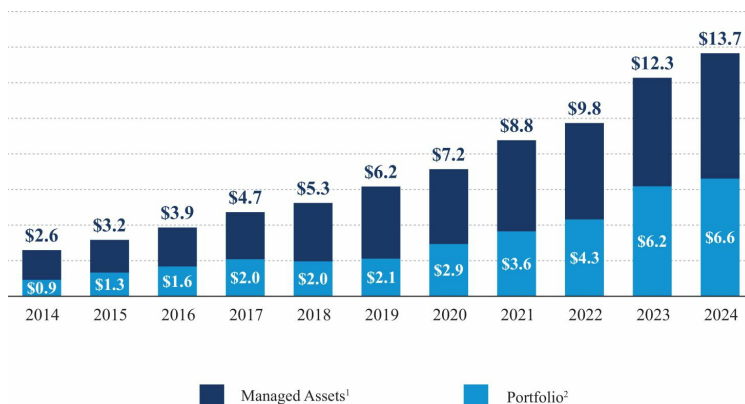
Managed Assets ($ billion)